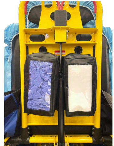
Headrest 2-Pouch Tray