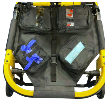
Headrest 4-Pouch Tray