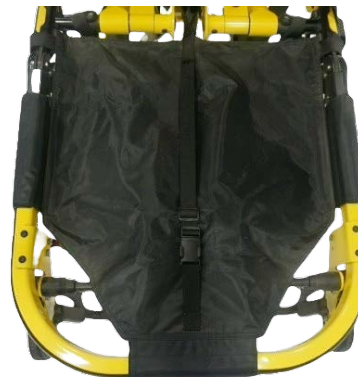
Head End Flat Tray