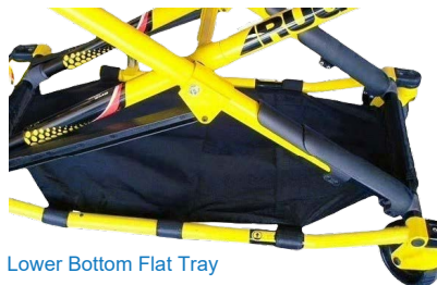
Lower Bottom Flat Tray